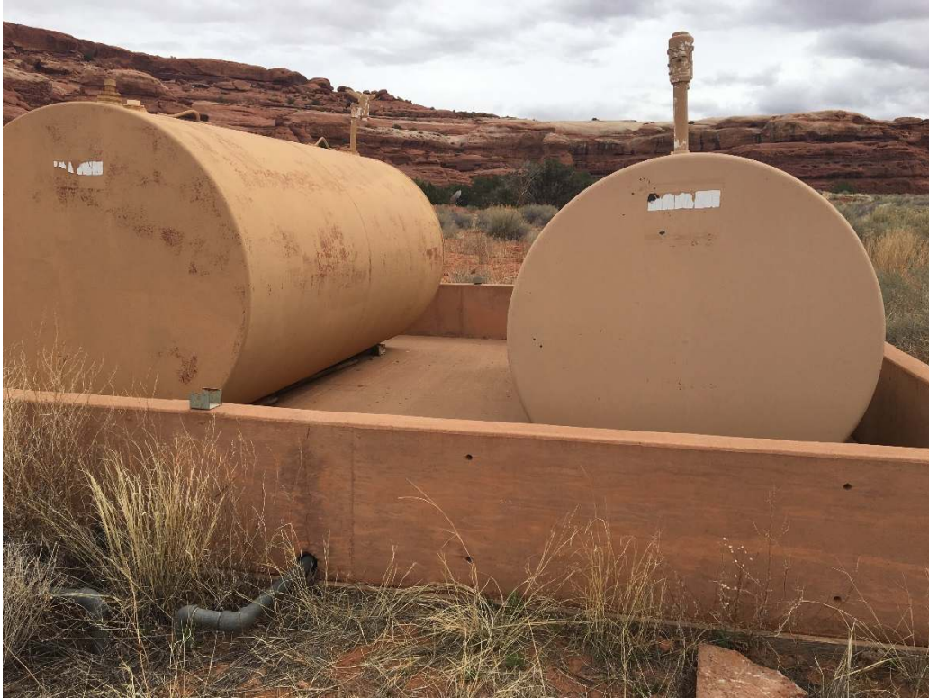
Aboveground Storage Tanks