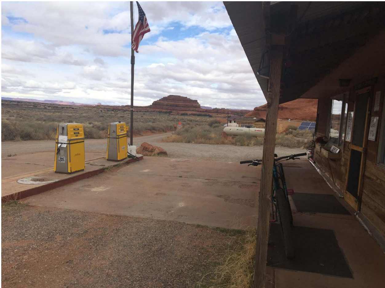
Needles Outpost SULA 51