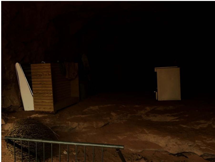
Some Containers in Cave