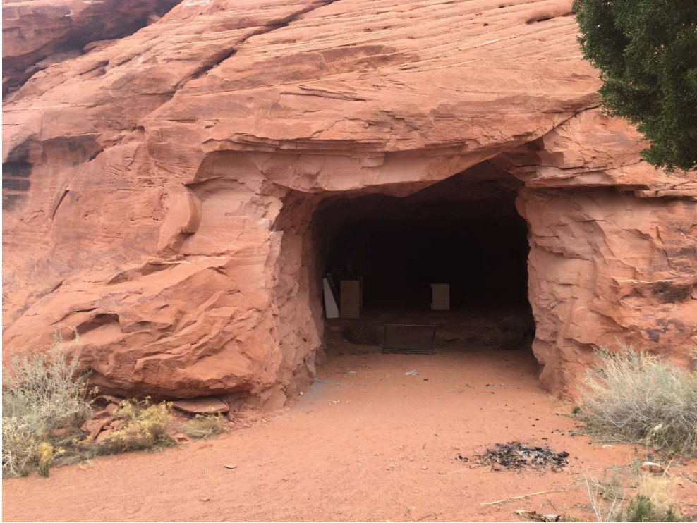
Entrance to Cave