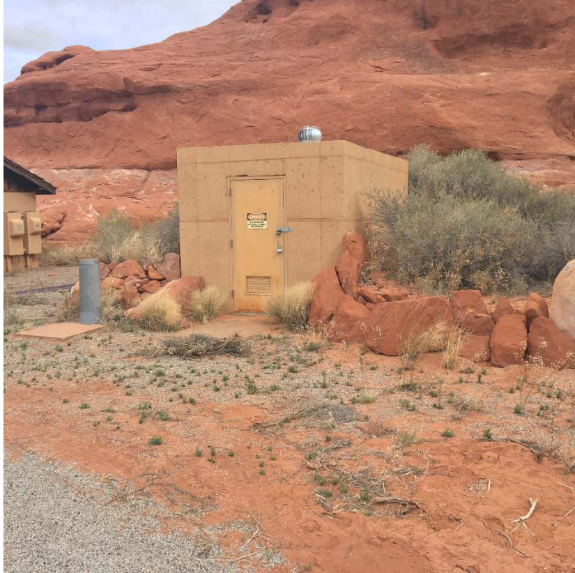
Solar Battery Storage