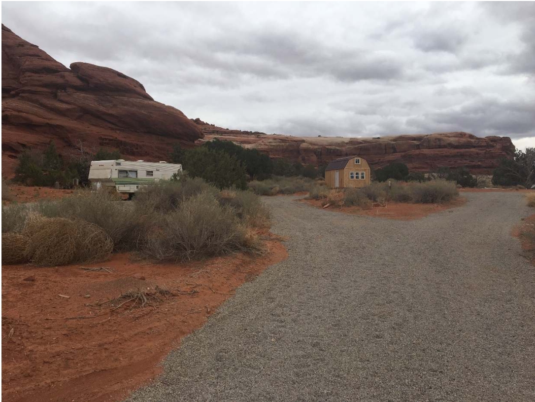
Motor Home and Shed