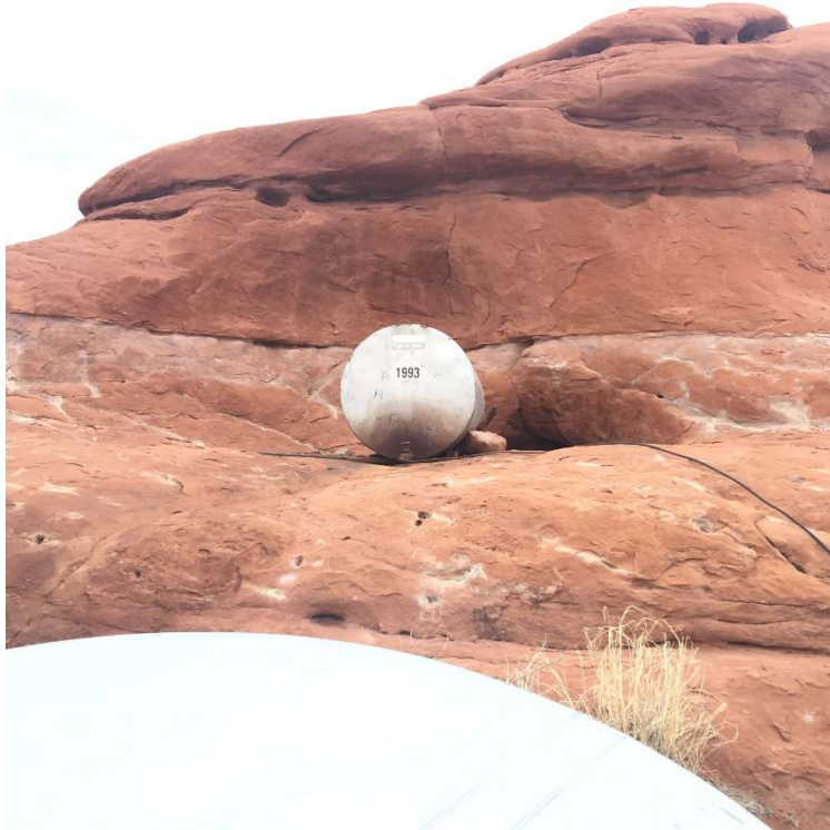
Diesel Tank on Slickrock to be Removed