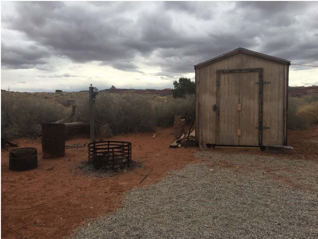
Burn Container and Shed