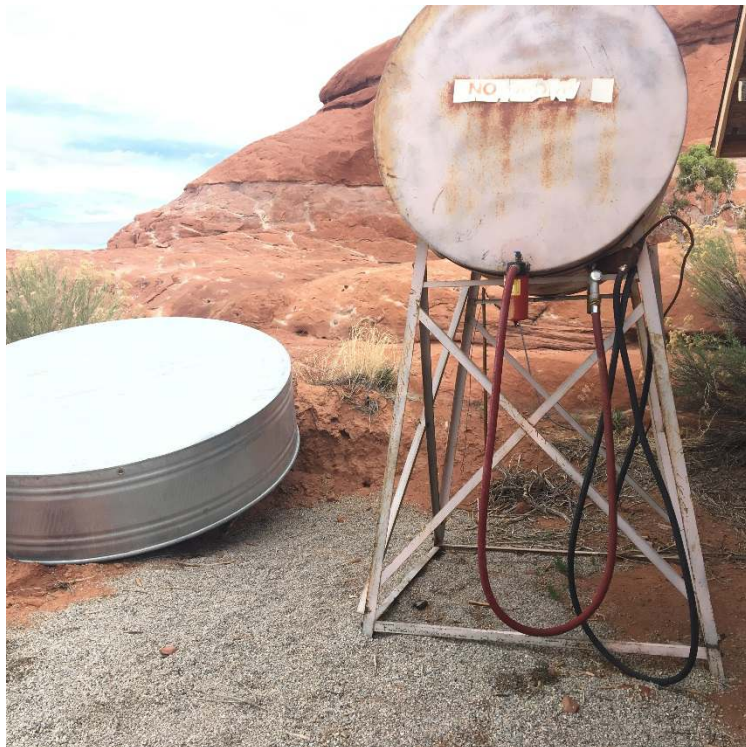
Secondary Containment needs to be under AST