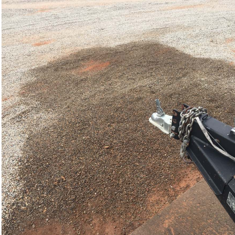
Close up of Spill