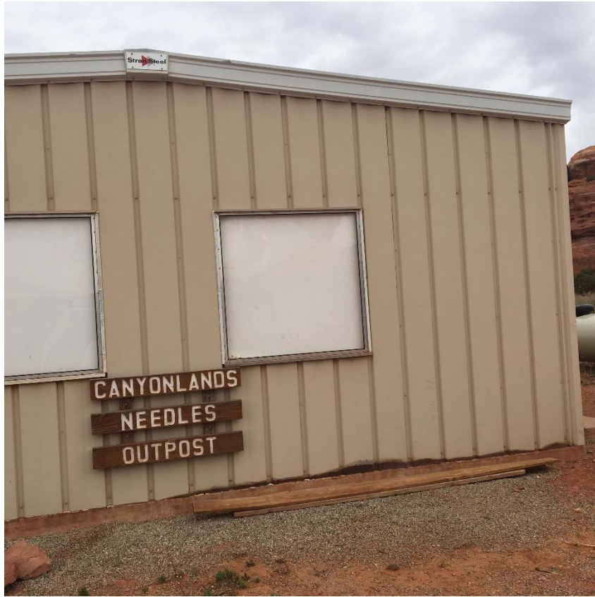
Guest Showers and Water System near Camp Areas